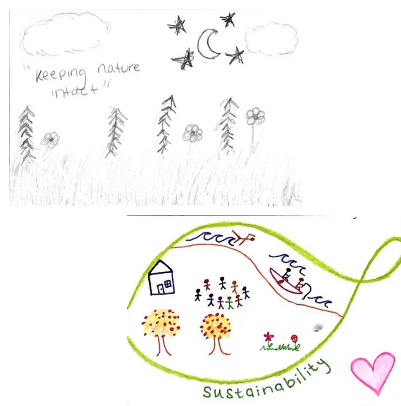
Figure 2: Visuals created by interview participants in response to the prompt "Please draw something that represents your, or your organization's, vision of sustainability". This method allows for visual representation of concepts along with spoken expression in the interviews.