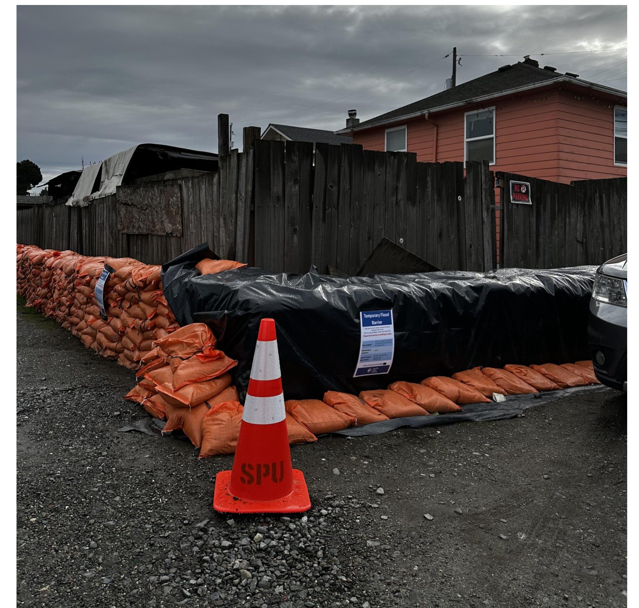
Figure 2: Temporary flood barriers in the Duwamish Valley area