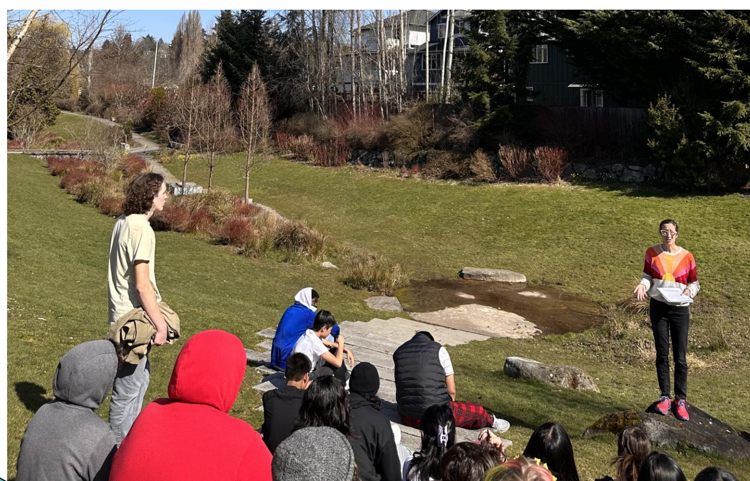
Figure 1: Tour of Maddison Valley Stormwater Storage Facility